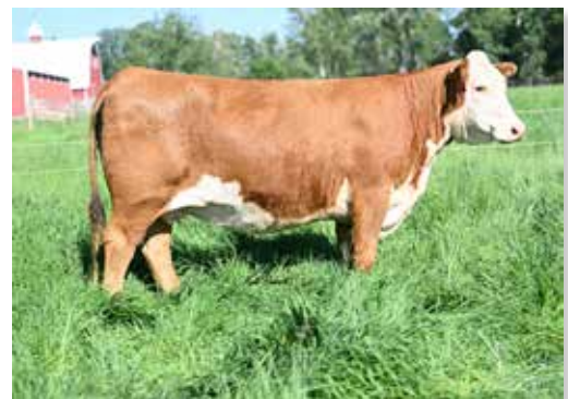
CL1 DOMINETTE 7209E DONOR DAM OF 3013L, 3039L, 3040L, 3044L, 3048L, 3060L, 3063L, 3078L & 3084L.

FLUSH BROTHERS SELL AS 3013L, 3039L, 3044L, 3048L, 3060L, 3063L, 3078L, & 3084L