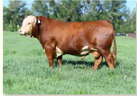
CL 1 DOMINO 776E 1ET SIRE OF 3102L, 3109L, 3118L, 3125L, & 3138L