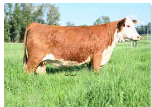
LW 3006 MISS ADVANCE 720E DONOR DAM OF 3012L, 3041, 3054L, 3065L, 3075L & 3084L

FLUSH BROTHERS SELL AS 3012L, 3041L, 3065L, 3075L, & 3081L