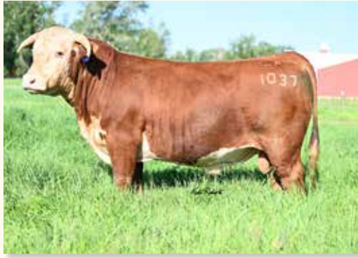
LW 6128 DOMINO 1037J SIRE OF 3059L, 3077L, 3093L, 3116L, & 3147L