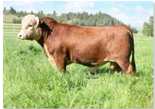
CL 1 DOMINO 1190J 1ET SIRE OF 3034L, 3066L, & 3086L