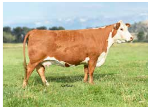
HH MISS ADVANCE 3070A ET DONOR DAM OF 3100L, K2206, & K2210