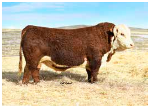
CL1 DOMINO 9108G 1ET SIRE OF 3064L, 3097L, 3100L, & 3146L