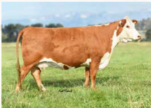
HH MISS ADVANCE 3070A ET DONOR DAM OF K2206 & K2210