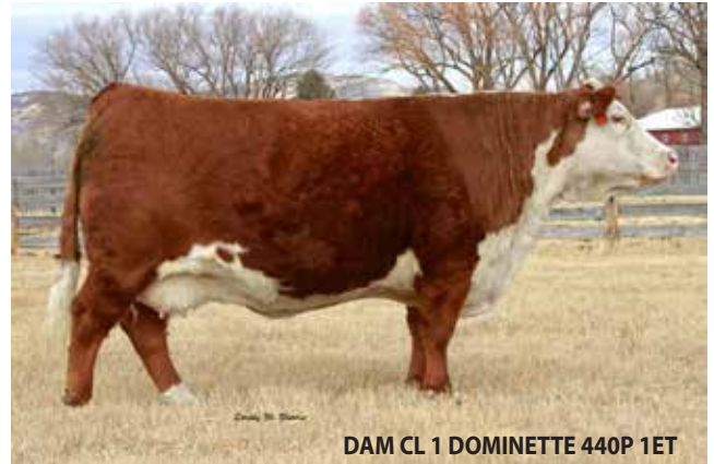
DAM CL 1 DOMINETTE 440P 1ET