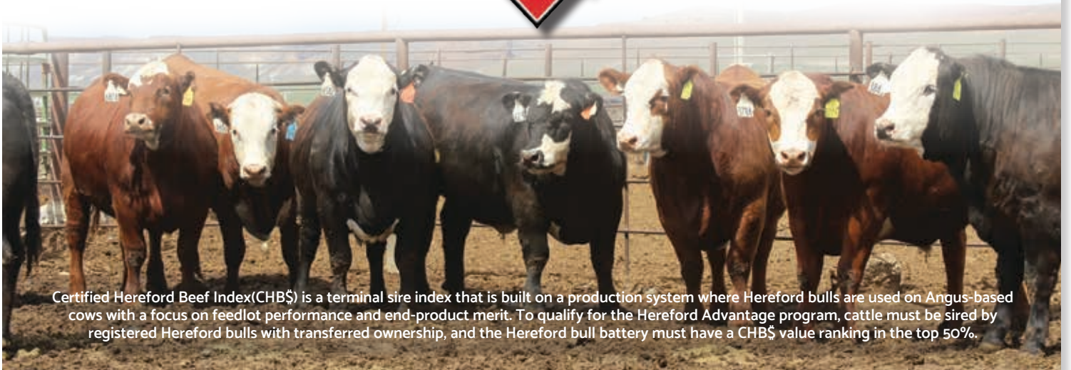
Certified Hereford Beef Index(CHB$) is a terminal sire index that is built on a production system where Hereford bulls are used on Angus-based cows with a focus on feedlot performance and end-product merit. To qualify for the Hereford Advantage program, cattle must be sired by registered Hereford bulls with transferred ownership, and the Hereford bull battery must have a CHB$ value ranking in the top 50%.